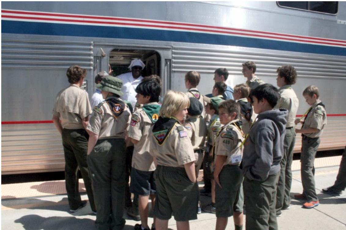
BOY SCOUT RAILROADING MERIT BADGE DAY, APRIL 24th

The Railroad Festival is coming up in October, so mark it on your calendar. There will be many activities throughout the County, including Railroad Story Times at local libraries, a list of local train layouts open to the public for the weekend, a swap meet, a kid's play area, face painting, and a bike ride along the historic Pacific Coast Railway right-of-way. Stay tuned for more info.