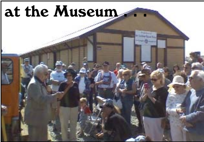
On October 10, 2009, San Luis Obispo Mayor Dave Romero reads a proclamation dedicating the Museum display track prior to driving the Golden Spike to finish the job.