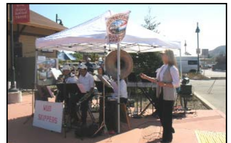
The Mud Skippers provided the music.