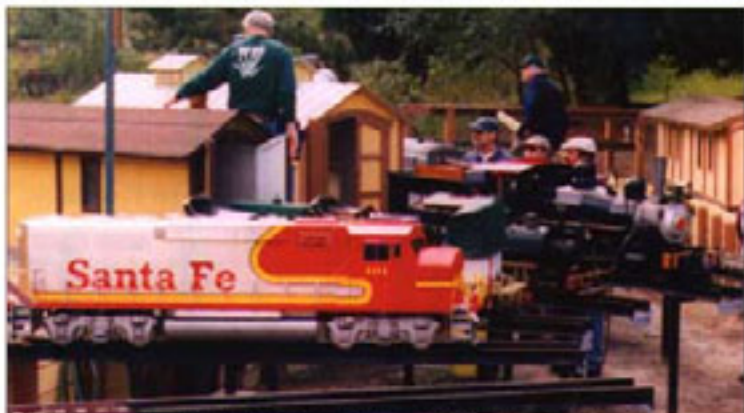
Engineers in the pit get their locomotives ready for the day's running.