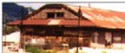
A recent picture of the south end of the Freighthouse/Museum.

These techniques could result in substantial cost savings on the